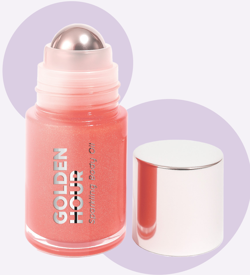
GLASS BOTTLE WITH ROLL-ON 50 ML MK/LC-GB50221-01