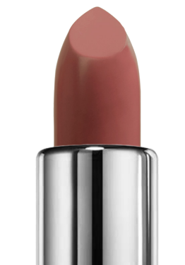
THE NUDE SOUL