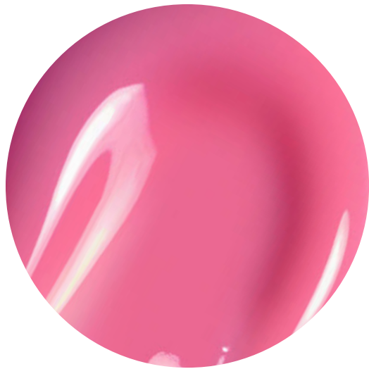
BALLERINA AROMA: SICILIAN DATE + SUGAR COD. MK/EF-8126PRD